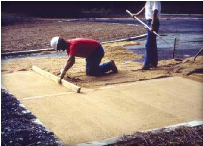
Figure 6a & 6b. Screeding the bedding sand.

spread and compacted, the aggregate base should be at its optimum moisture. Bases for pedestrian areas and residential driveways should be compacted a minimum 98% of standard Proctor density. For vehicular areas, compaction should be at least 98% of modified Proctor density as determined by ASTM D 1557, or AASHTO T180. While the highest percentage compaction (100%) is preferred, it may not be achievable on weak or saturated soils. Density measurements of the compacted base should be made with a nuclear density gauge or other methods approved by the local, state or provincial transportation department. See Figure 5. Unless otherwise specified, the compacted thickness of individual lifts and the final base should be +3/4 in. to -1/2 in. (+19 mm to -13 mm). Maintaining consistent lift thickness during compaction will help achieve consistent density. Variation in final base surface elevations should not exceed \pm 3/8 in. ( \pm 10 mm) when tested with a 10 ft. (3 m) straightedge.