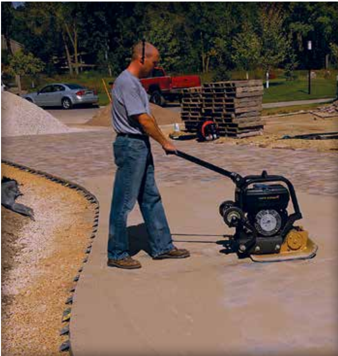
Figure 11. Vibrating sand into the joints.

Cut pavers should be used to fill gaps along the edge of the pavement. Pavers are cut with a double bladed splitter or a masonry saw. See Figure 8. A saw gives a smooth cut. Gaps greater than \frac{3}{8} in. (10 mm) should be filled with cut pavers. For street applications do not cut pavers to less than \frac{1}{3} their original size. Instead fill voids with two cut pavers.