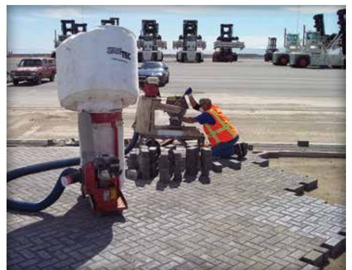
Figure 8. Saw cutting pavers.