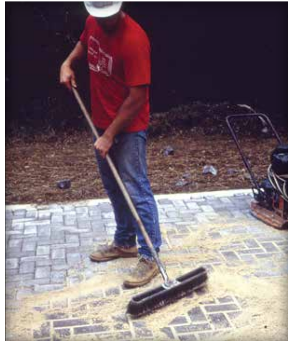
Figure 10. Spreading and sweeping joint sand.