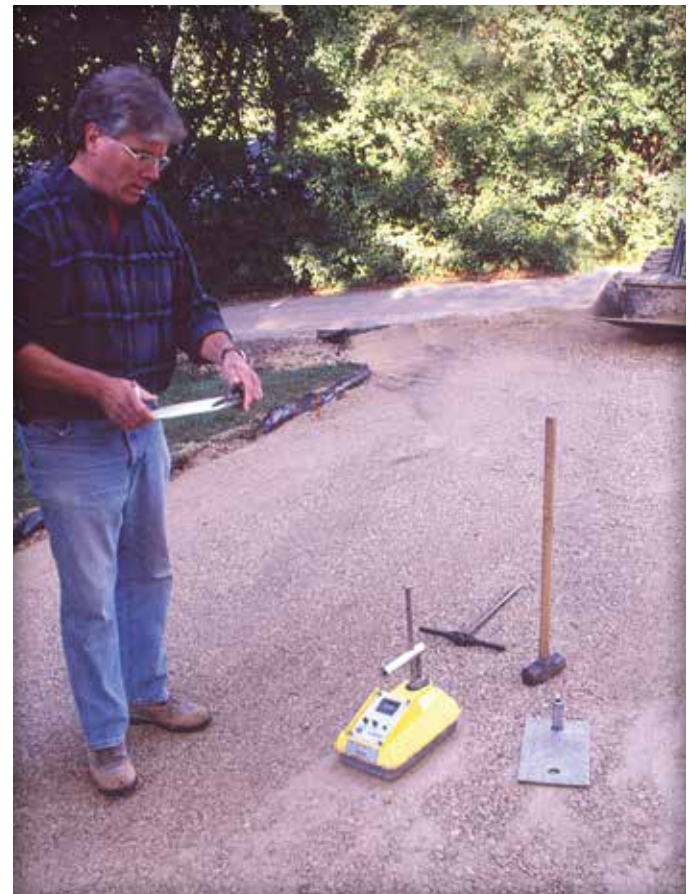
Figure 5. Density testing of the aggregate base with a nuclear density gauge.

Like compaction of the soil subgrade, adequate compaction of the base is critical to minimizing settlement of interlocking concrete pavements. See Figure 4. Special attention should be given to achieving compaction standards adjacent to edge restraints, catch basins and utility structures. When