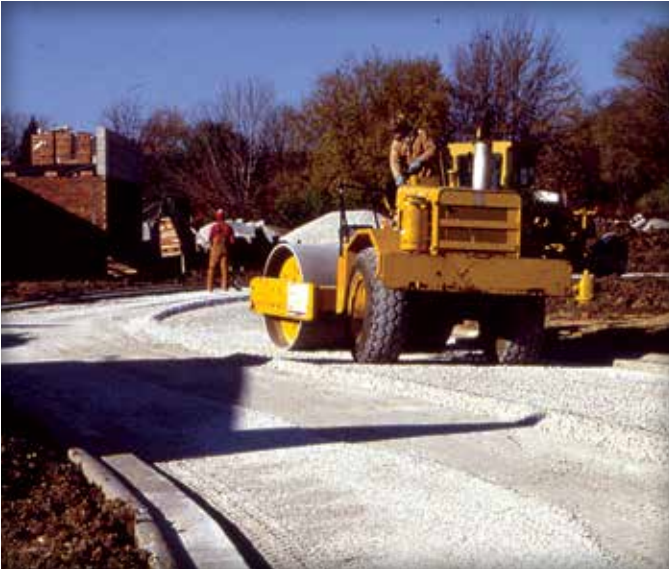
Figure 4. Base compaction with a vibratory roller.

When the fabric is placed in the excavated area, it should be turned up along the sides of the opening, covering the sides of the base layer. There should be no wrinkles on the bottom. When the aggregate is dumped on the fabric, the tires from trucks should be kept off the fabric to prevent wrinkling.