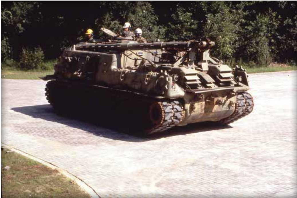
Figure 13. The completed paved area from Figure 12 receives tank traffic at the U.S. Army Proving Grounds in Aberdeen, Maryland.

ICPI Tech Spec 5—Cleaning, Sealing and Joint Sand Stabilization of Interlocking Concrete Pavement for further guidance.