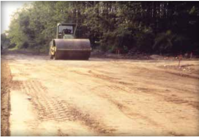
Figure 2. Compacting the soil subgrade.