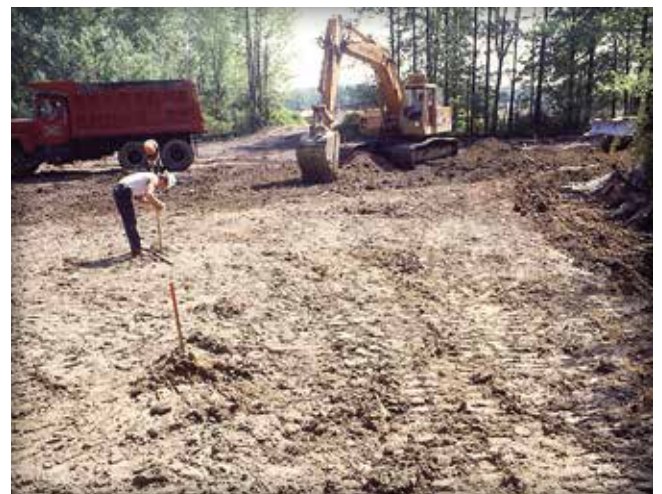
Figure 1. Excavation of the soil subgrade and placing grade stakes.

Installation steps include job planning, layout, excavating and compacting the soil subgrade, applying geotextiles (optional), spreading and compacting the sub-base and/or base aggregates, constructing edge restraints, placing and screeding the bedding sand, and placing concrete pavers. For larger installations mechanical placement of pavers may be more economical. Refer to Tech Spec 11—Mechanical Installation of Interlocking Concrete Pavements for additional information.