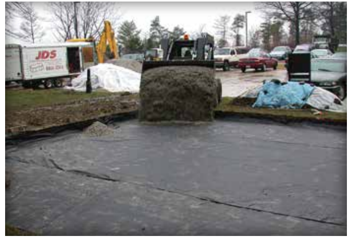
Figure 3. Application of the geotextile under aggregate base.