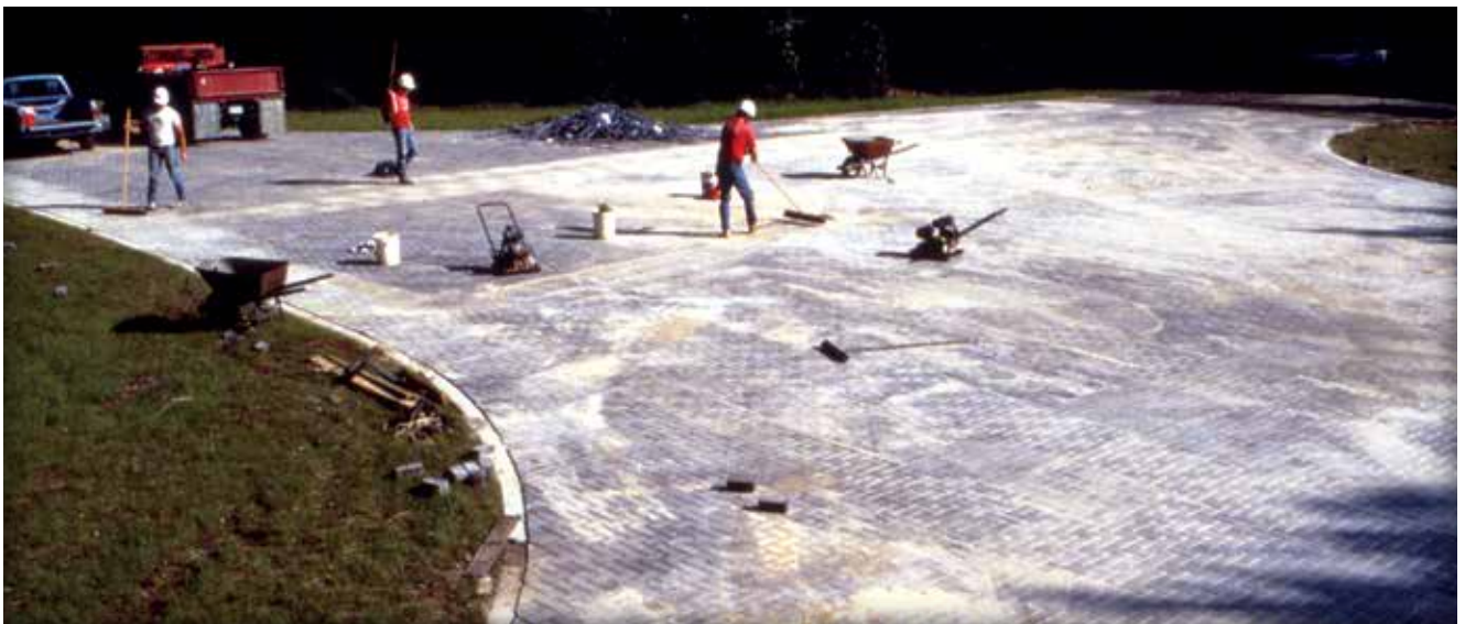
Figure 12. Excess sand swept from the finished surface will make the pavement ready for traffic.

Final surface elevations should not vary more than \pm\frac{3}{8} in. ( \pm 10 mm) under a 10 ft (3 m) straightedge, unless otherwise specified. Bond or joint lines should not vary \pm\frac{1}{2} in. (13 mm) over 50 ft (15 m) from taut string lines. The top of the pavers should be \frac{1}{8} to \frac{3}{8} in. (3 to 10 mm) above adjacent catch basins, utility covers, or drain channels, with the exception of areas required to meet ADA design guideline tolerances. The top of the installed pavers may be \frac{1}{8} to \frac{1}{4} in. (3 to 6 mm) above the final elevations to compensate for possible minor settling. A small amount of settling is typical of all flexible pavements. Optional sealers or joint sand stabilizers may be applied. See