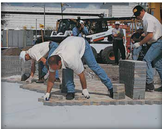
Figure 7. Placing the concrete pavers.

Edge restraints are a key part of interlocking concrete pavements. By providing lateral resistance to loads, they maintain continuity and interlock among the paving units. Aluminum, steel, plastic, or concrete are typical edge restraints. Consult ICPI Tech Spec 3 on edge restraints for recommendations on